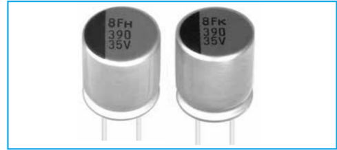
Marking color : Blue print