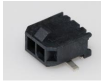
Power Connector Molex: 43650-0212