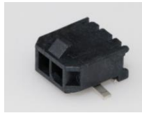
Power Connector Molex: 43650-0212