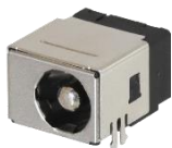
DC Jack 2.5mm x 5.5mm